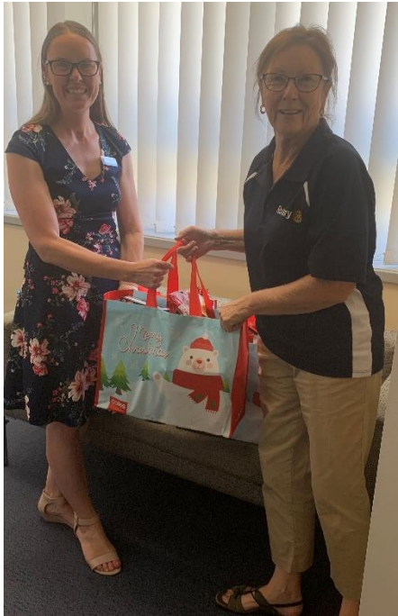
Thank you to Penrith Valley Rotary for our donated hampers