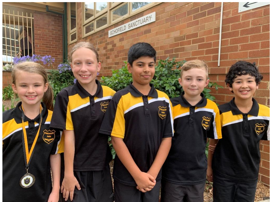
Student Leadership team 2021

We have an exciting day planned with robotics, sports and cultural activities!