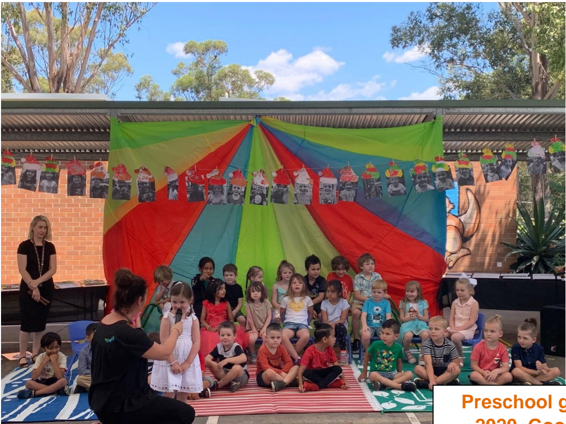
Preschool graduation 2020. Good luck at Kindergarten!