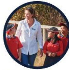
Build skills through fun